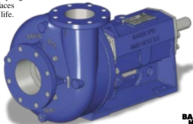
Baker SPD Centrifugal Pump, the MUD HOG™